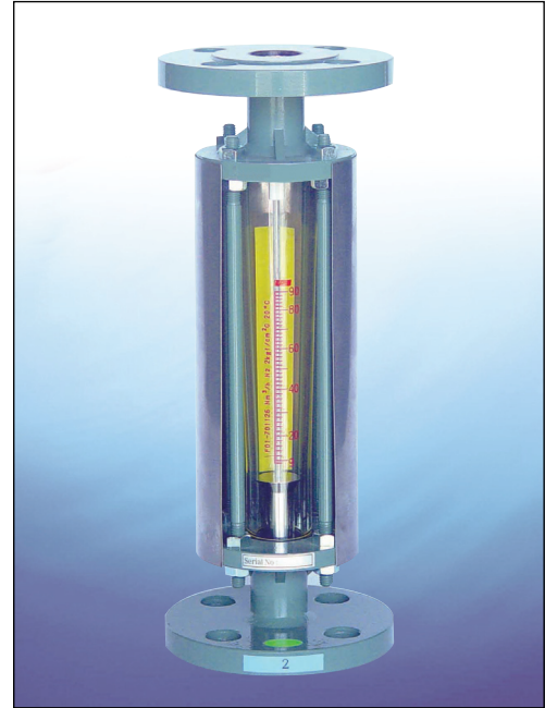
MODEL : CGPC Series